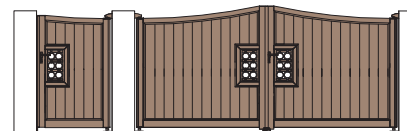
NO CENTRAL RAIL

Gates without a central crossrail apart from diagonal boards and curved top sliding gates