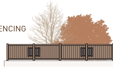
CONSTANCE Fence minimum height 900 mm